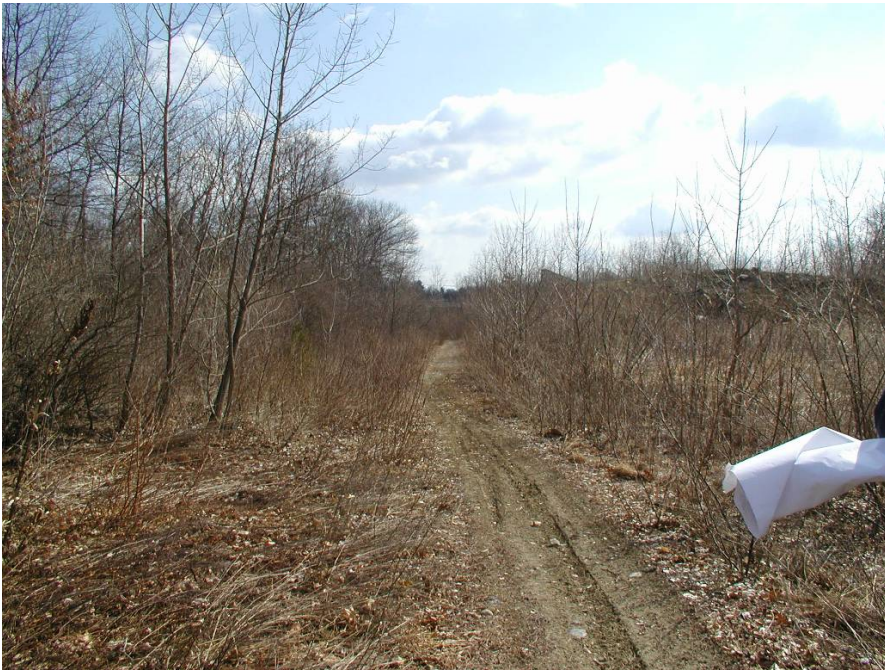
Photo 2: Looking east on National Grid property Photo date: March 25, 2008