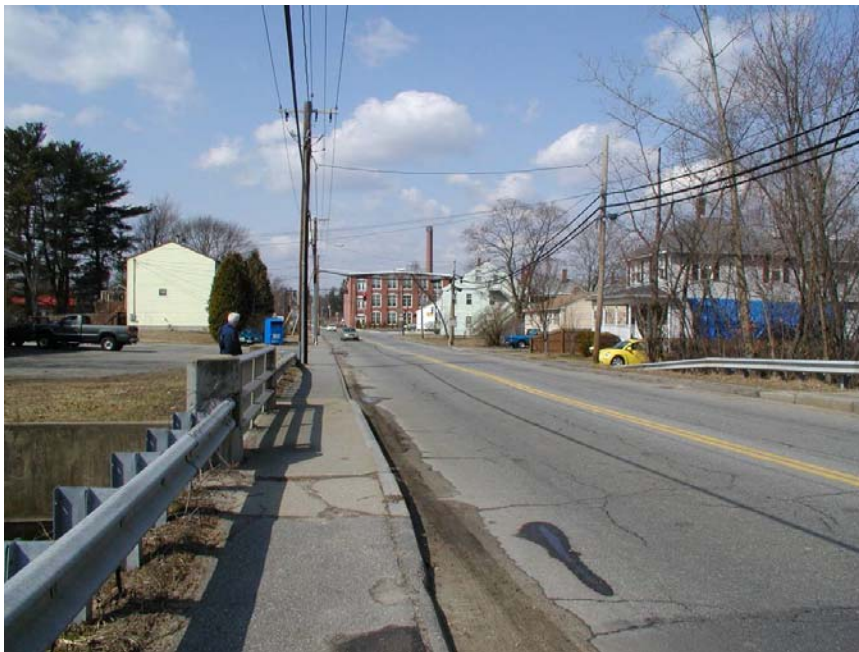
Photo 1: Looking west along Grafton Street bridge over the watercourse that flows from Woolshop Pond. Photo date: March 25, 2008.