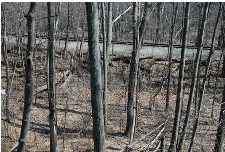
Photo 1: Looking northeast at the P&W rail line from St. Patrick's Cemetery. Photo date March 31, 2006