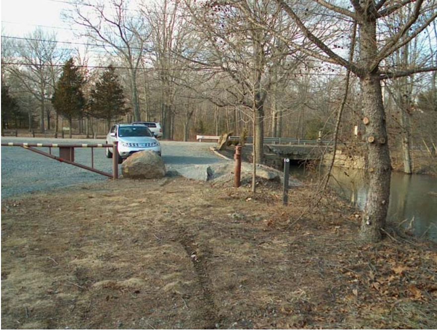
Photo 2: Looking north along the existing Plummer's Trail at the Plummer's Landing parking area. Photo date: February 19, 2008