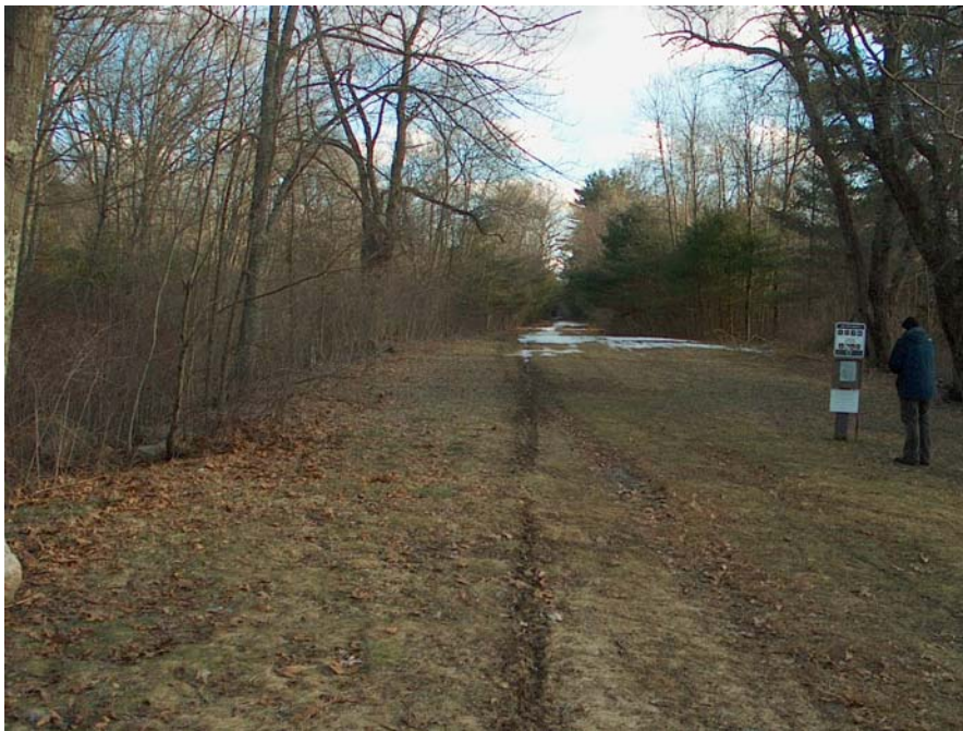
Photo 1: Looking south along the existing Plummer's Trail. Photo date February 19, 2008