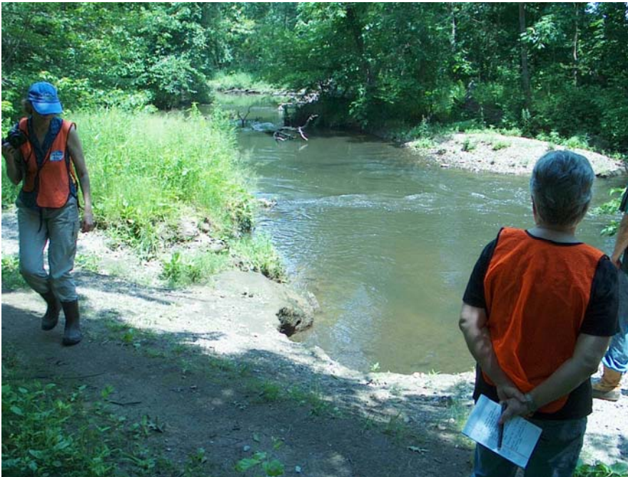
Photo 3: Looking east at an eroded portion of the existing Plummer's trail. The Blackstone River has breached into the canal in this area, and the resulting canal flow appears to be scouring the existing trail embankment. This would need to be repaired if the bikeway would be on this alignment. Photo date: July 1, 2008