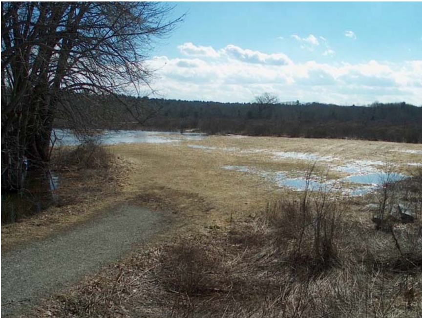
Photo 3: Looking southeast from the existing tow path at a seasonally flooded field that the 'Walking Path' alignment would pass through. Photo date: February 19, 2008