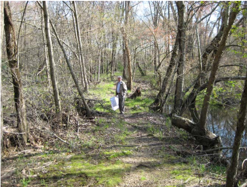
Photo 4: Looking north at the wooded portion of the existing walking path. Photo date: May 6, 2008