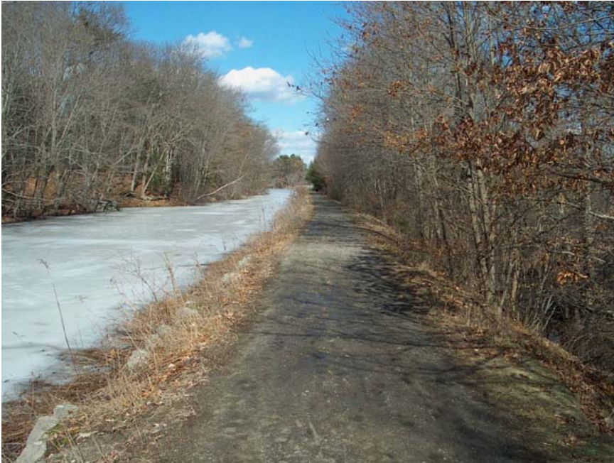
Photo 2: Looking north along the canal tow-path within BR&CH State Park. Photo date: February 19, 2008