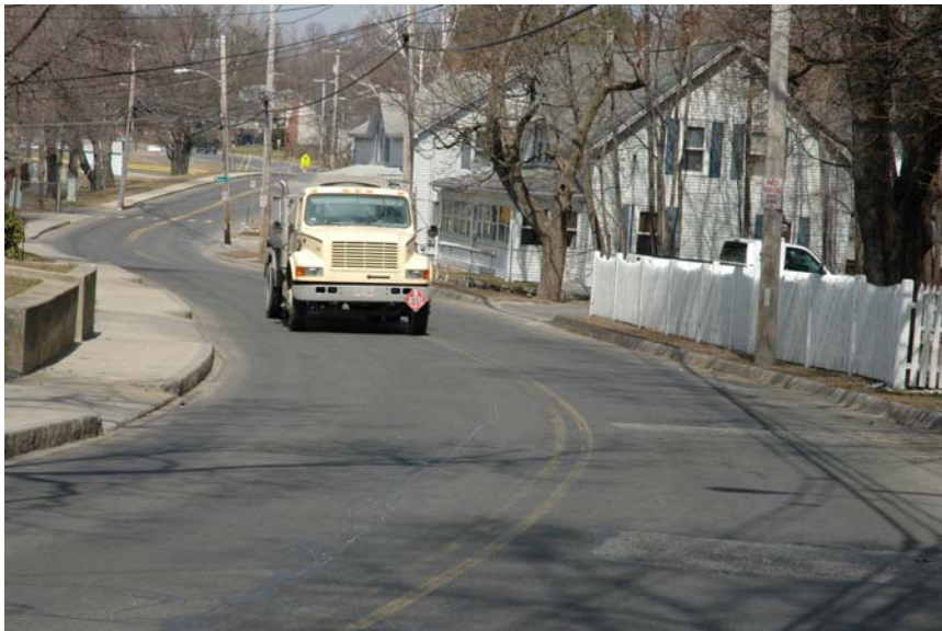
Photo 1: Looking south on Capron Street near Mendon Street. Photo date: March 31, 2006.