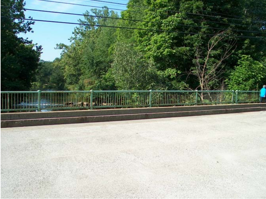
Photo 2: Looking south from the Route 16 bridge over the Blackstone River. The off-road alignment would parallel the west (right of photo) bank of the river in this section. Photo date: July 18, 2008.