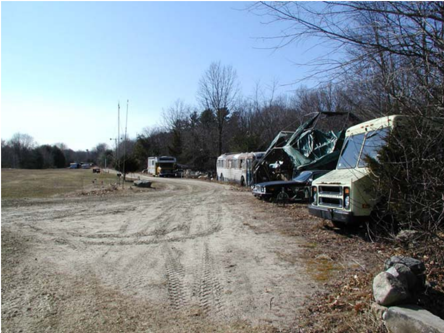
Photo 3: Looking west at the Wassenaar Property from the existing rail right-of-way. Photo date: March 25, 2008.