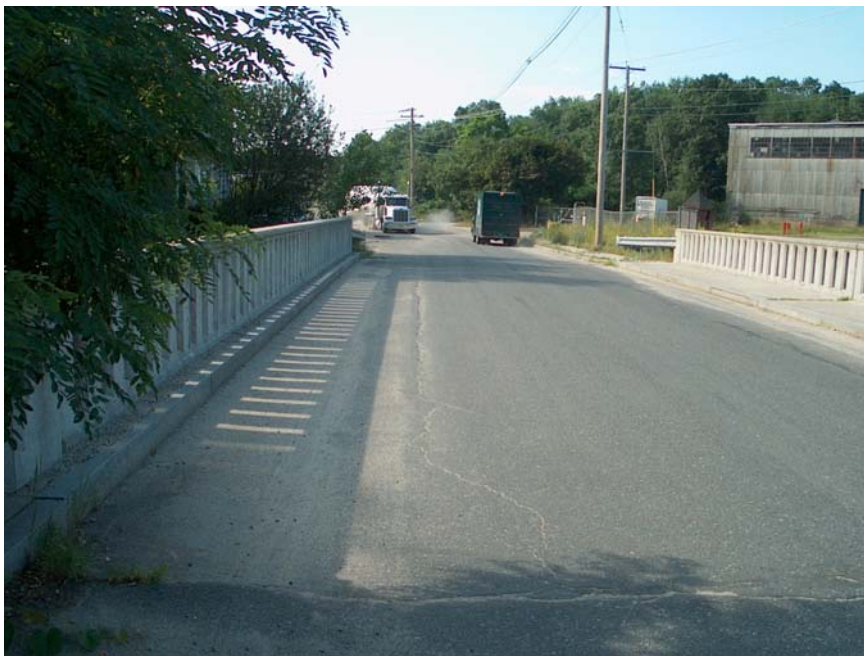
Photo 1: Looking south at the existing Mumford River Crossing at Depot Street Photo date: July 18, 2008.